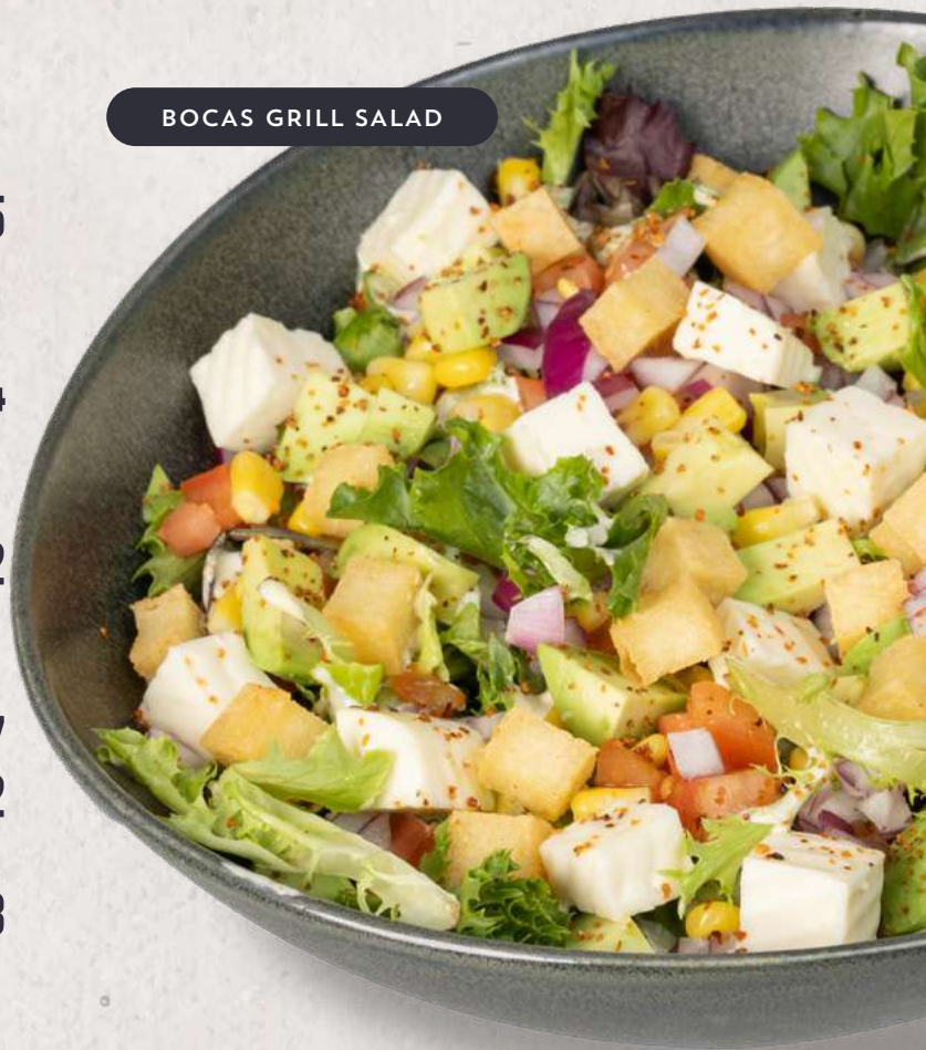
BOCAS GRILL SALAD