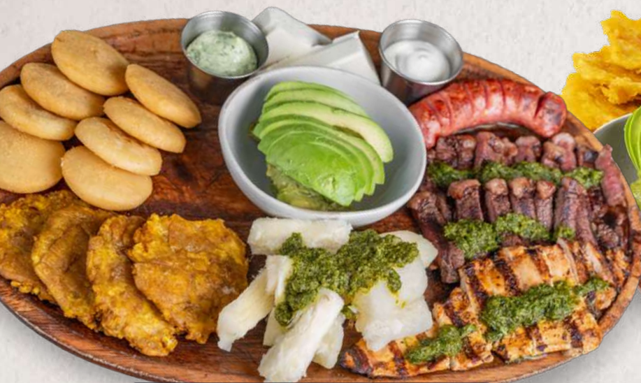
PARRILLA MIXTA BOCAS GRILL