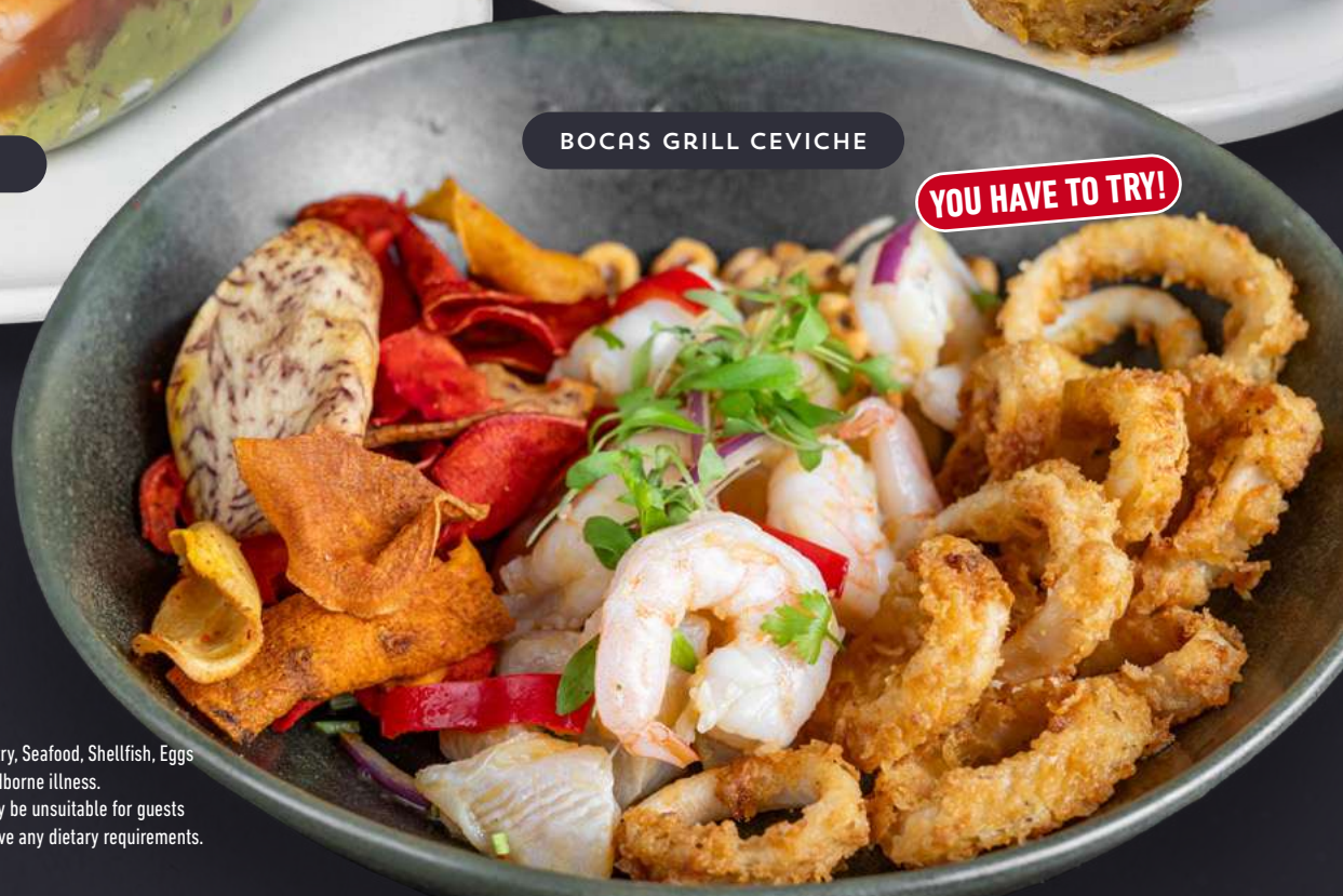
BOCAS GRILL CEVICHE