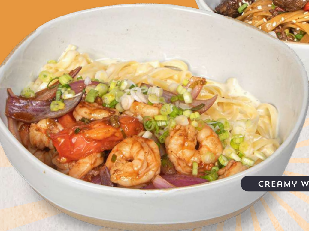
CREAMY WOK SMOKED SHRIMP