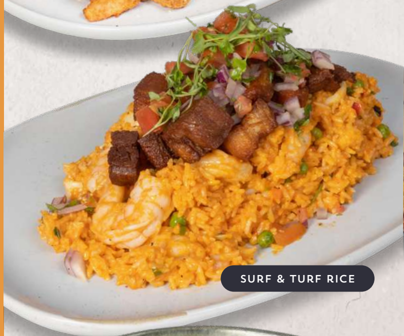
SURF & TURF RICE

Rice in Seafood Cream with Calamari and Shrimps, Red Bell Pepper, Crispy Pork belly and Pico de Gallo (Tomatoes, Red Onion and Cilantro).