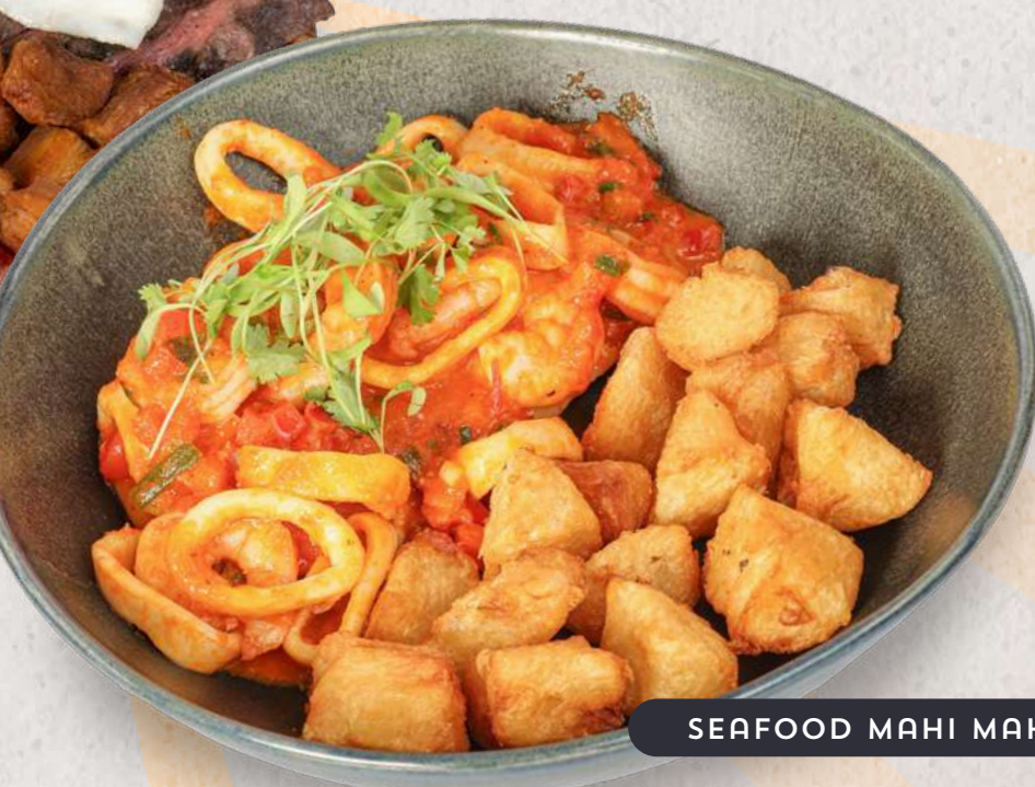
SEAFOOD MAHI MAHI