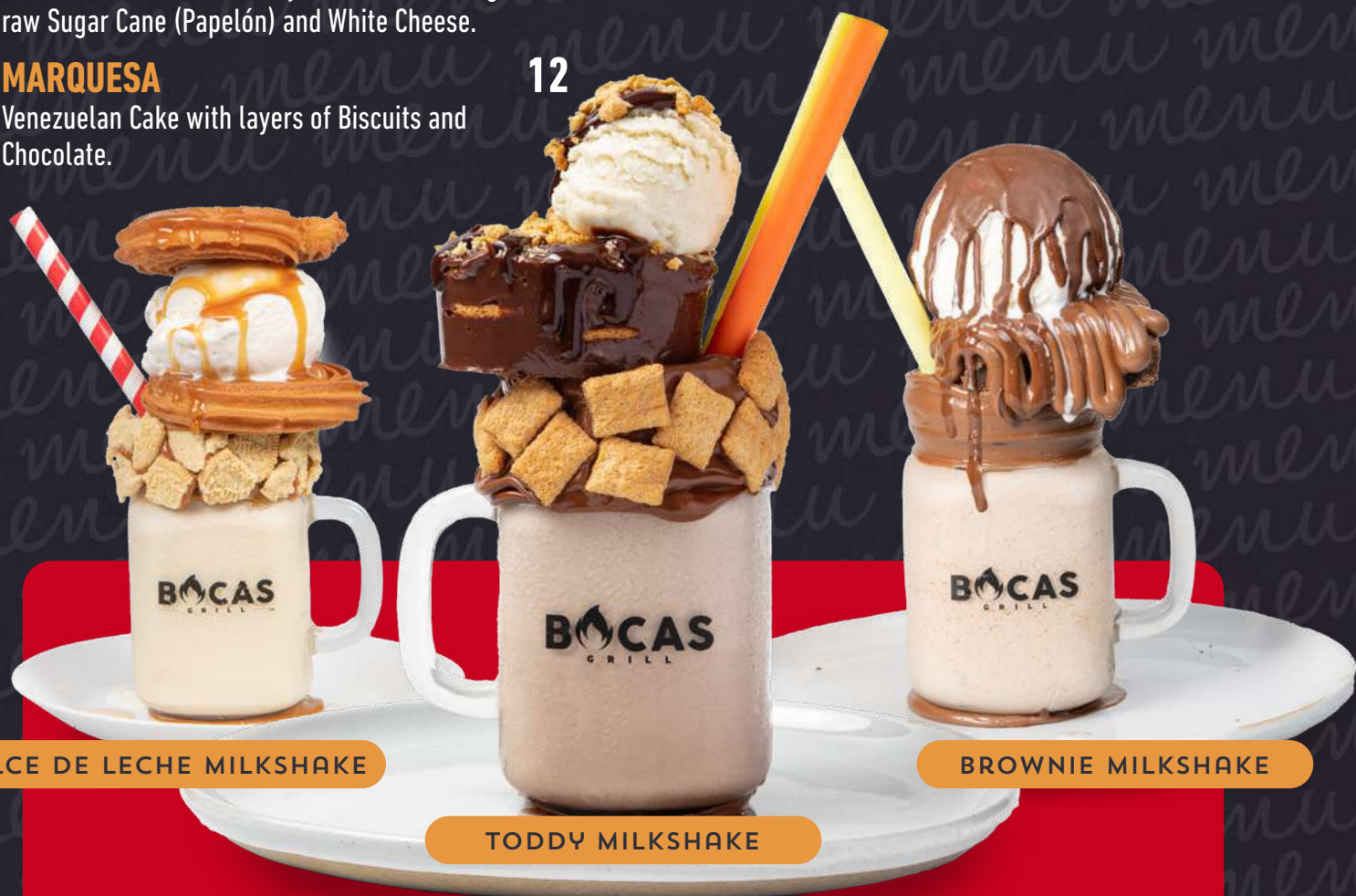
DULCE DE LECHE MILKSHAKE

Nutella Milkshake crowned with Fudgy Brownie, Ice Cream, and Nutella.