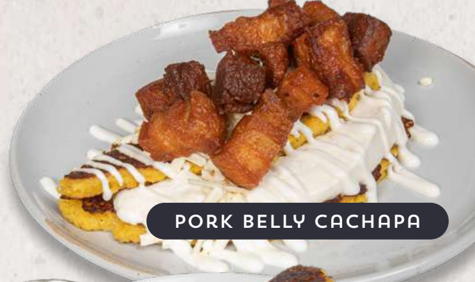
PORK BELLY CACHAPA