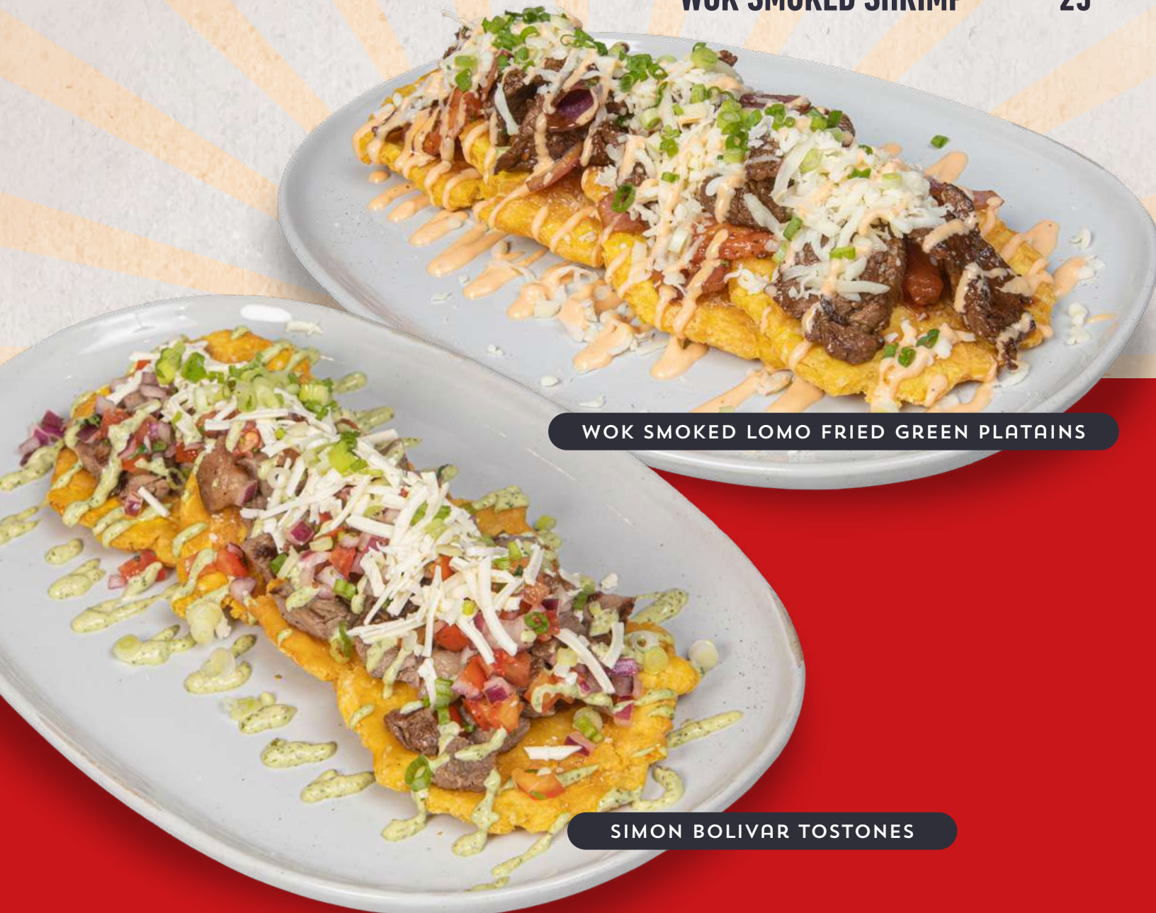
WOK SMOKED LOMO FRIED GREEN PLANTAINS