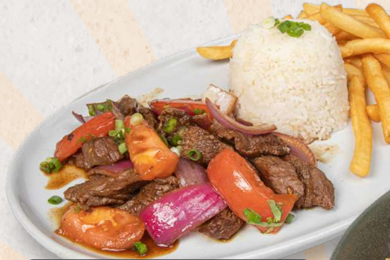
TRADITIONAL WOK SMOKED LOMO

Grilled Mahi-Mahi, Seafood Sauce with Calamari and Shrimps, accompanied by 2 sides of your choice.