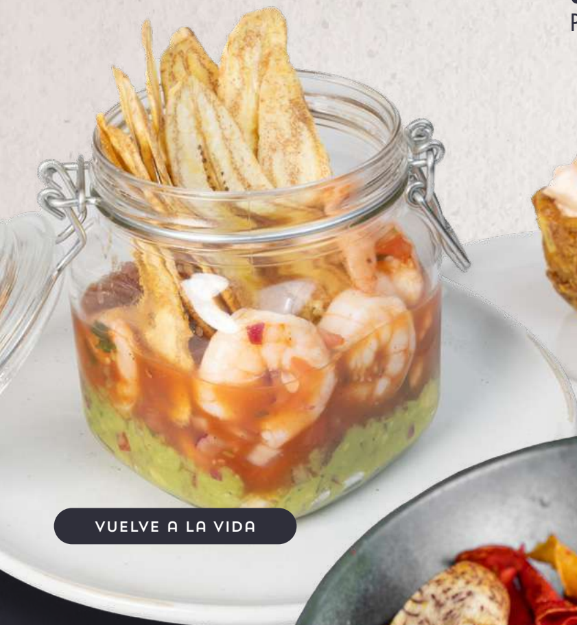
VUELVE A LA VIDA