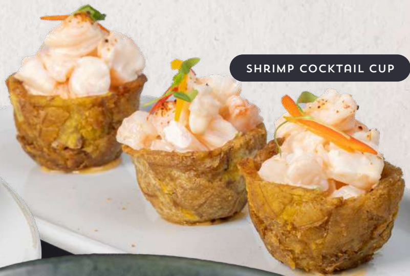
SHRIMP COCKTAIL CUP