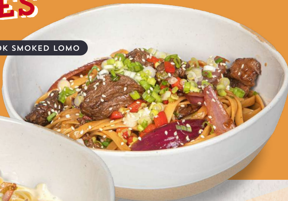
TRADITIONAL WOK SMOKED LOMO