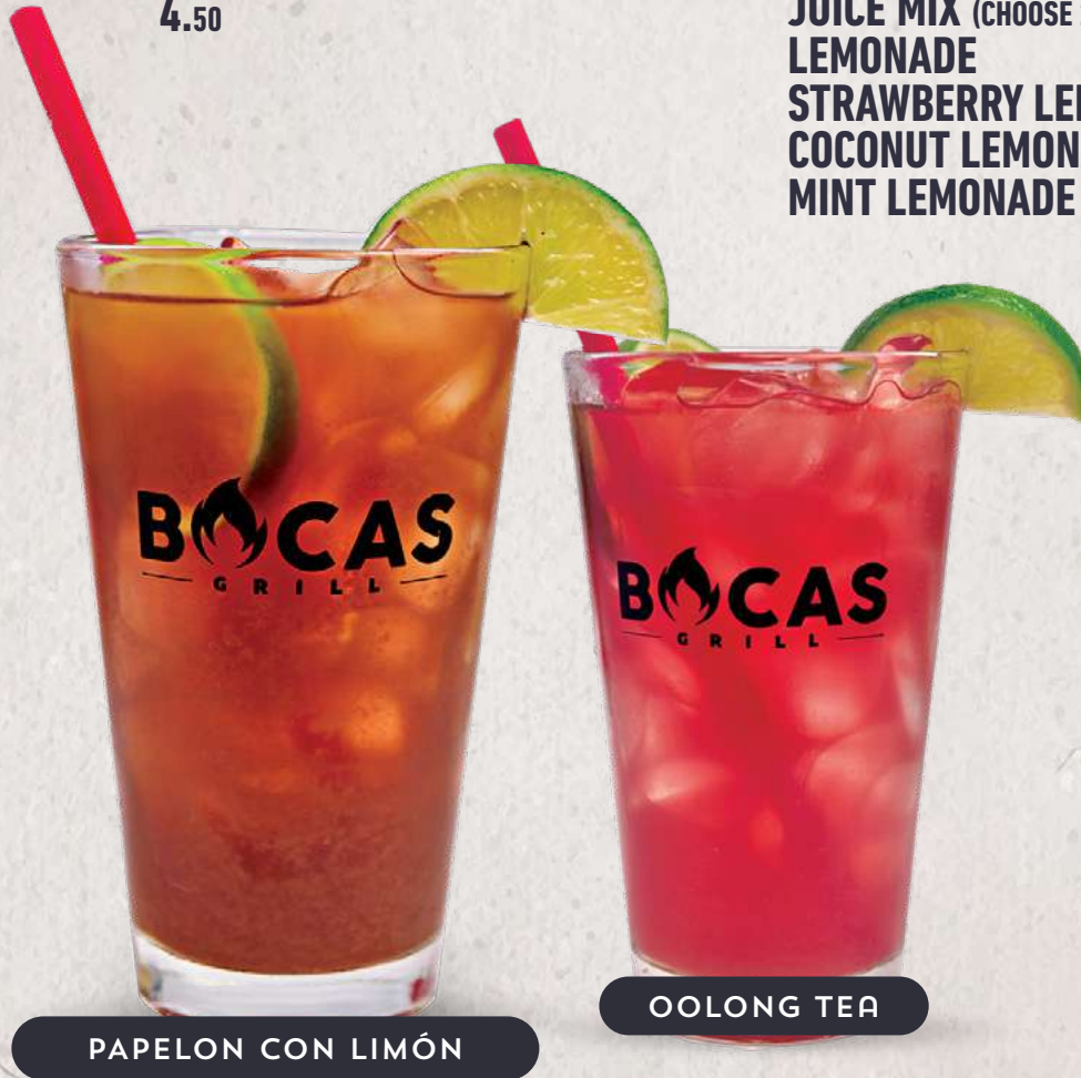
PAPELON CON LIMÓN