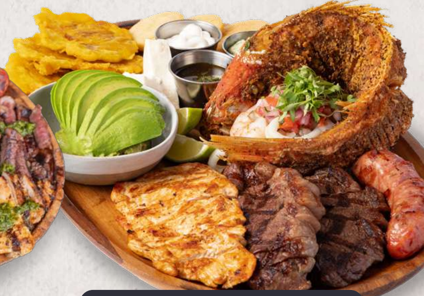
PARRILLA SURF & TURF DELUXE