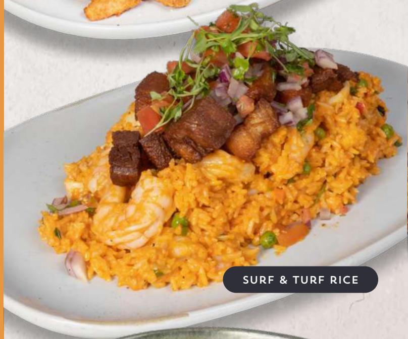
SURF & TURF RICE

Rice in Seafood Cream with Calamari and Shrimps, Red Bell Pepper, Crispy Pork belly and Pico de Gallo (Tomatoes, Red Onion and Cilantro).