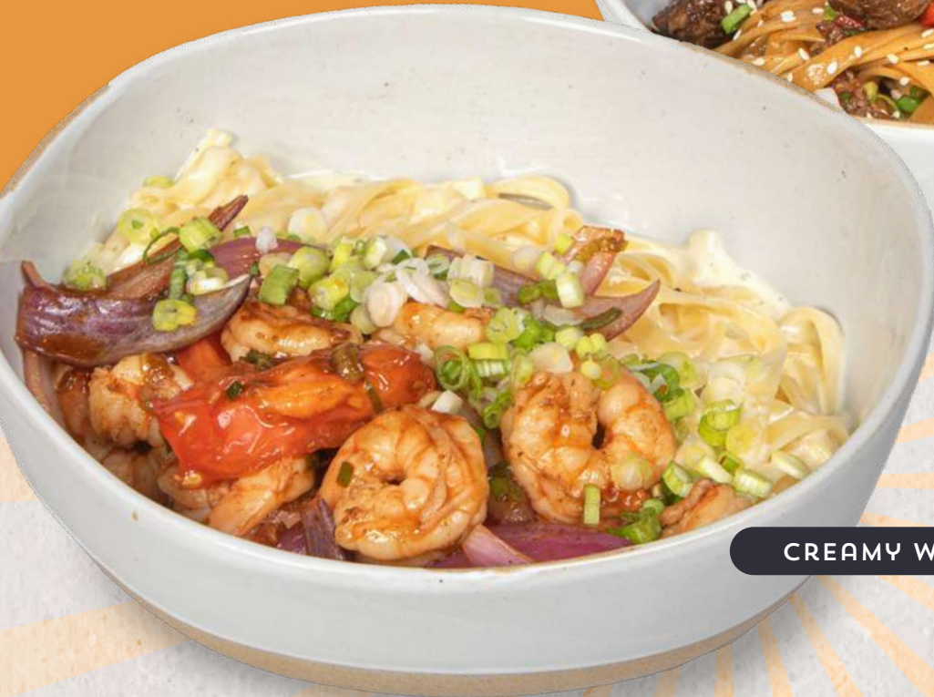
CREAMY WOK SMOKED SHRIMP